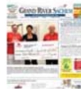
Grand River Sachem 19,000