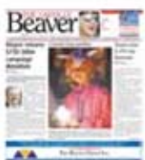
Oakville Beaver 49,000

Print campaigns include min 4 display advertisements in major print publications within a 40 minute commute to Careport Centre with over 1,000,000 circulation – per ad!: