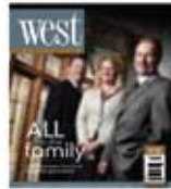
West of The City 35,000