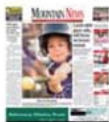
Hamilton Community News 114,800