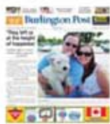
Burlington Post/Flamborough Review 72,868