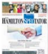
Hamilton Spectator 104,000