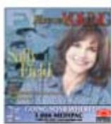
Forever Young News Magazine 582,100