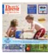
City Parent News Magazine 105,000