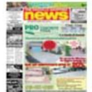
Oakville Shopping News 50,000 Burlington 50,000 Milton 24,000