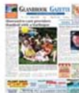
Glanbrook Gazette 6,650