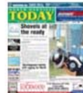
Oakville Today 32,000